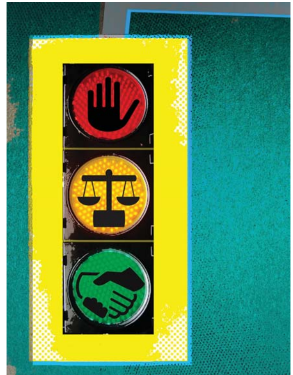
Illustration by Peter Giesbrecht

Guidelines have been amended in effect nine times with the most recent amended version of the Guidelines taking effect on November 1, 2012.